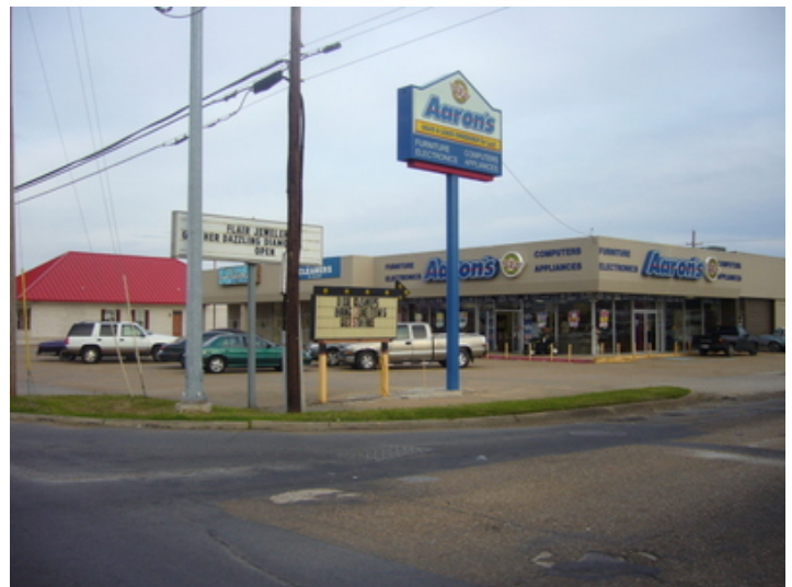
From 18th Street