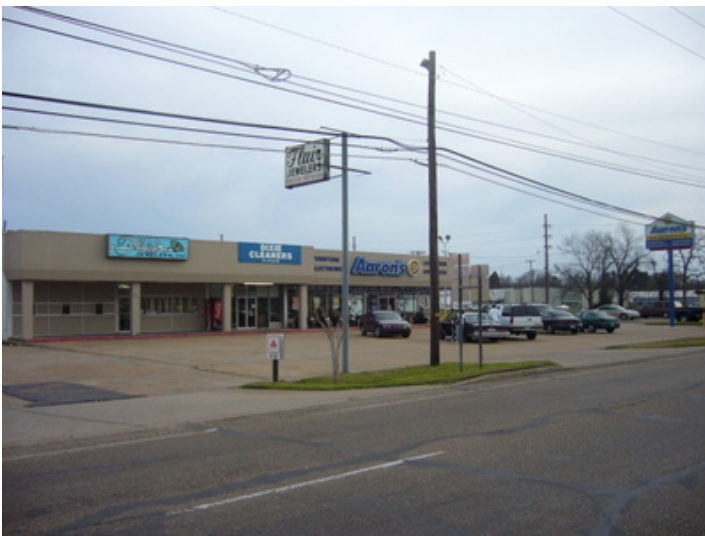
From Louisville Avenue